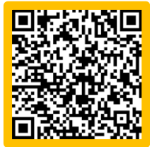
QR BY POSITION